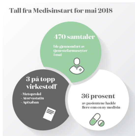
Illustration from The Norwegian Pharmacy Association

Doctors can request start-of-care guidance (“Medisinstart”) for their patients, but patients can also request the service themselves in pharmacies. One month after launch, 470 completed conversations were conducted (see graphic below).